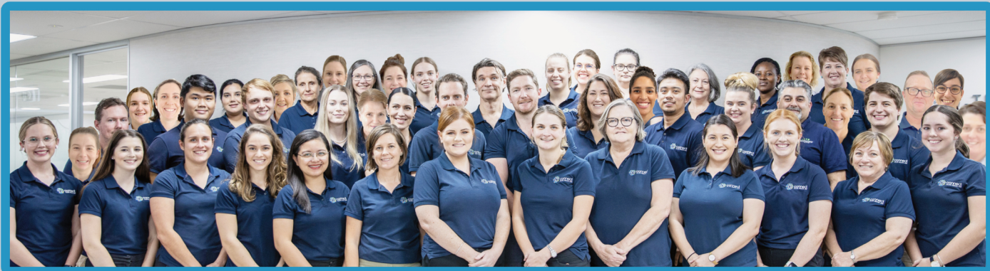
The whole team at The Physiotherapy Centre

The Physiotherapy Centre has been a vital part of Warwick's health and wellbeing for over 50 years... How much longer than 50 years is a very good question - we are not entirely sure!